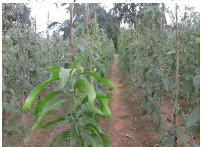
Intercrop taken by farmers in WADI field