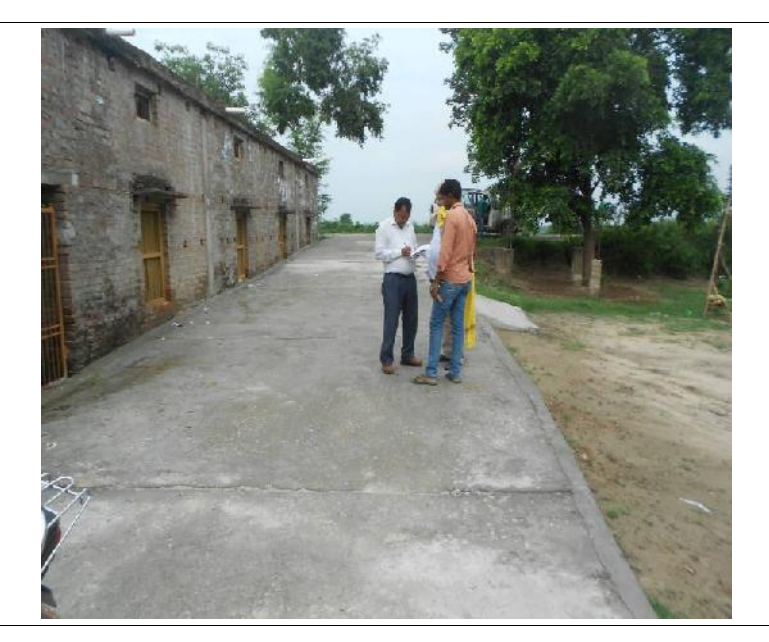
Third Party Verification works of Mandi & Grameen Awasthapna Kendra