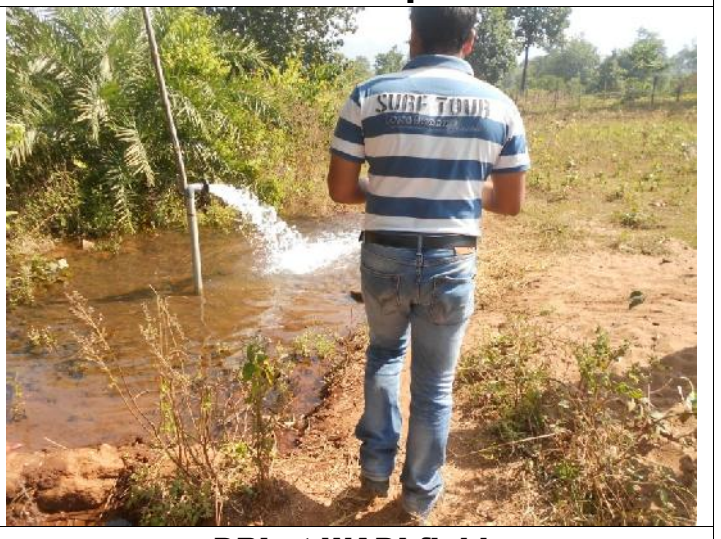
DBI at WADI field