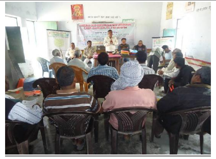
IWMP Training Programme for SHGs, UGs & WCs, office bearers & Members