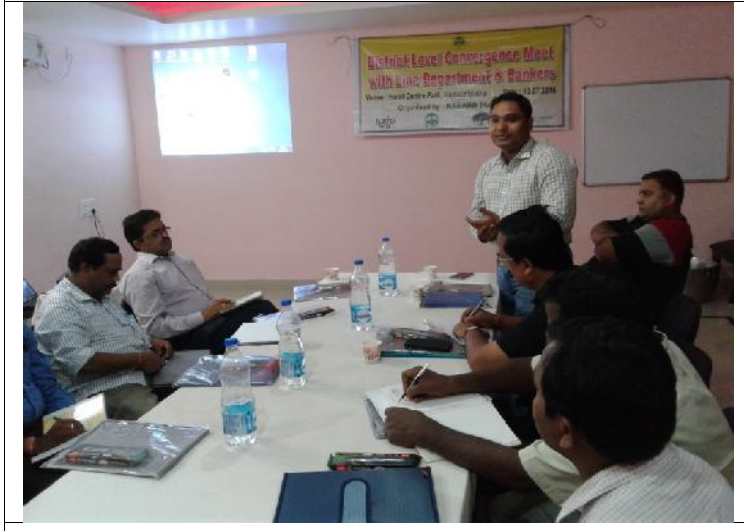
Organize of district level coordination meeting