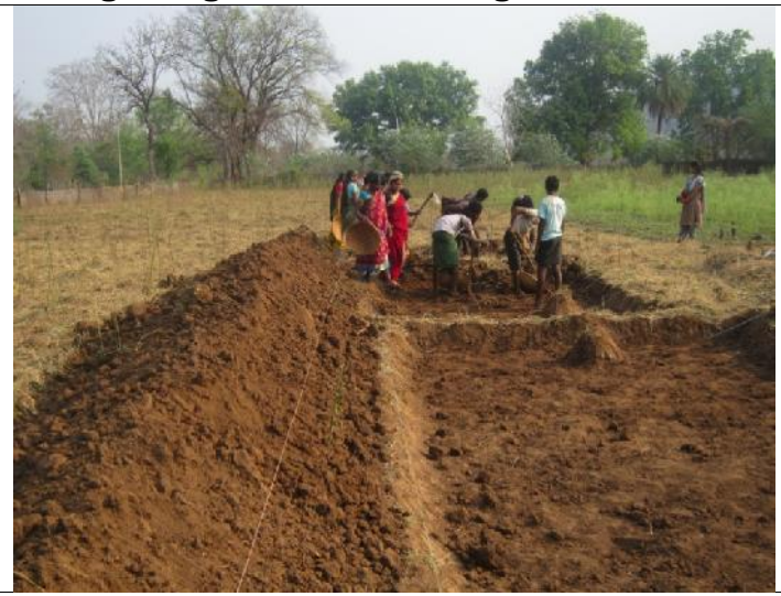
Soil works before WADI plantation