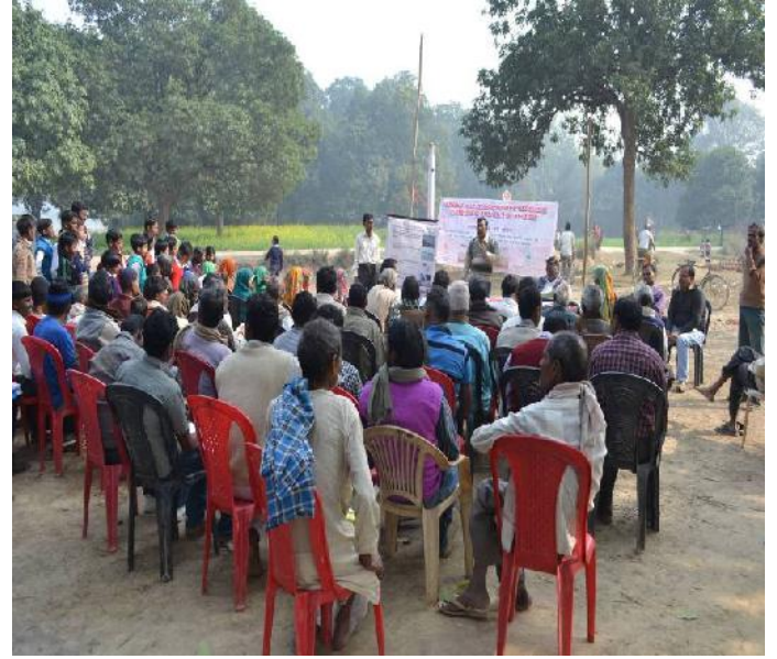
IWMP Training Programme for SHGs, UGs & WCs, office bearers & Members