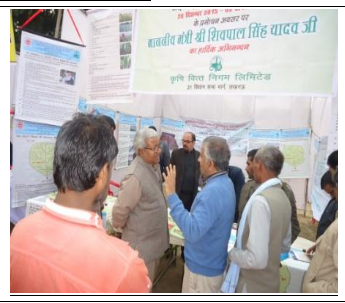
State Level Inauguration Workshop of IWMP Learning materials