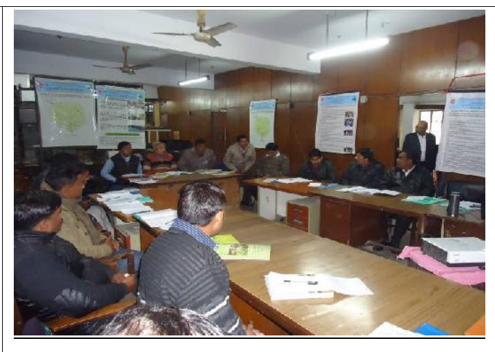
Training of Master Trainers (IWMP Project) at AFC, LKO Office