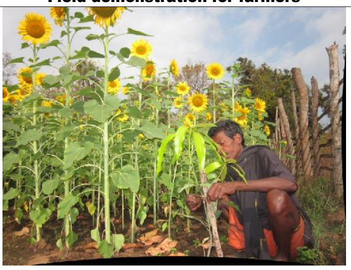
Sunflower as intercrop in WADI field