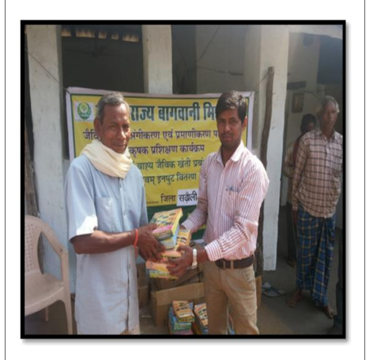
Input Distribution in District-Gariyaband