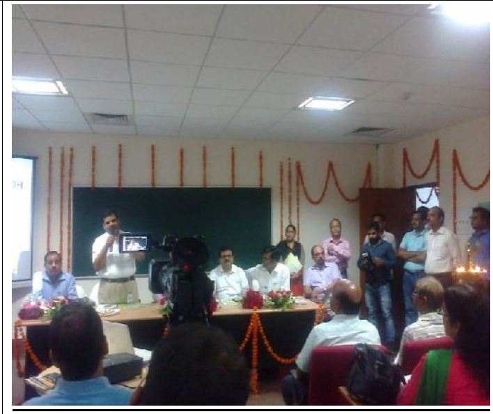
TOT of Master Trainer Panchayati Raj