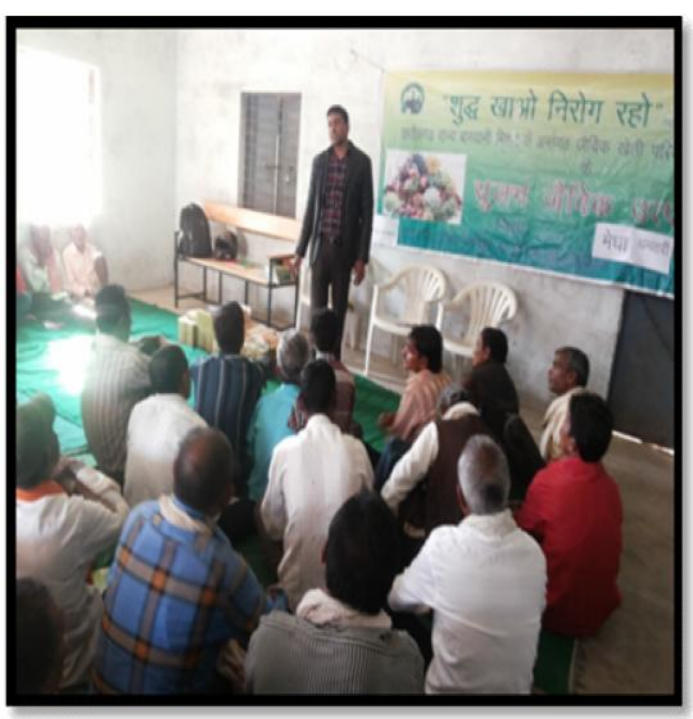
Organic Club Meeting in District Dhamtari