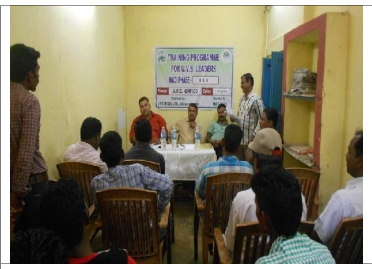
Trng. Prog. For WADI village level leaders