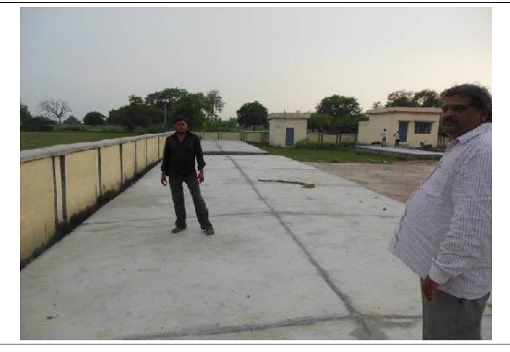
Third Party Verification works of Mandi & Grameen Awasthapna Kendra