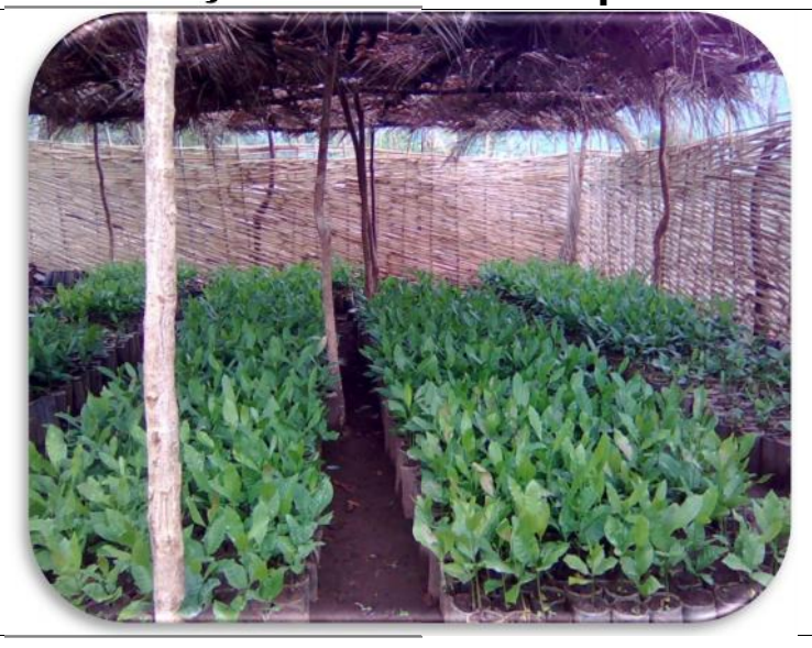
Raising of nursery by SHG members