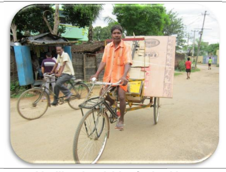
Livelihood activities for land less