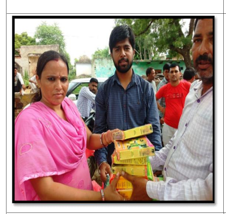
Input Distribution in District Narnaul