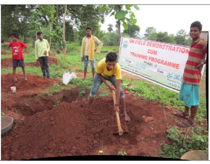
Field demonstration for farmers