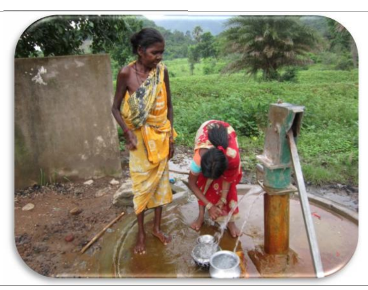
Increase of Ground water table after treatment