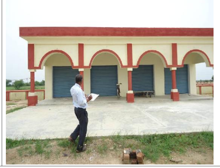
Third Party Verification works of Mandi & Grameen Awasthapna Kendra