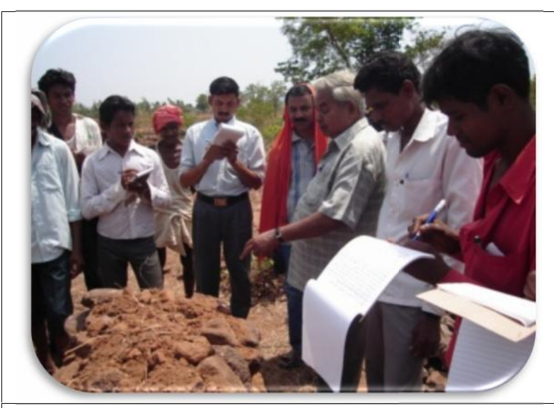
Field level Trng. Prog. For WDF village leaders