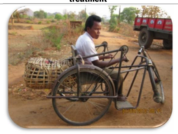
Poultry as Livelihood for PH person