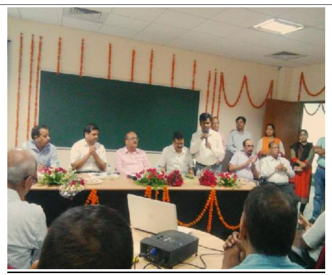
TOT of Master Trainer Panchayati Raj