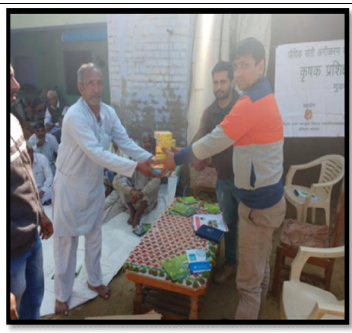
Input Distribution in District Jhajjar