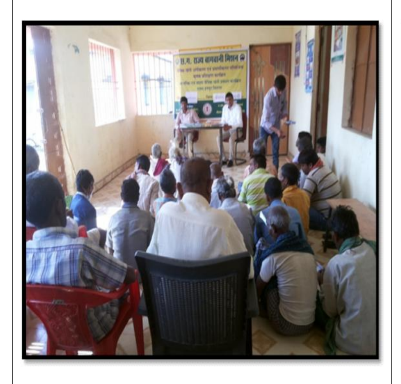
<u>Customized Farmers Training in</u> District Bemetara